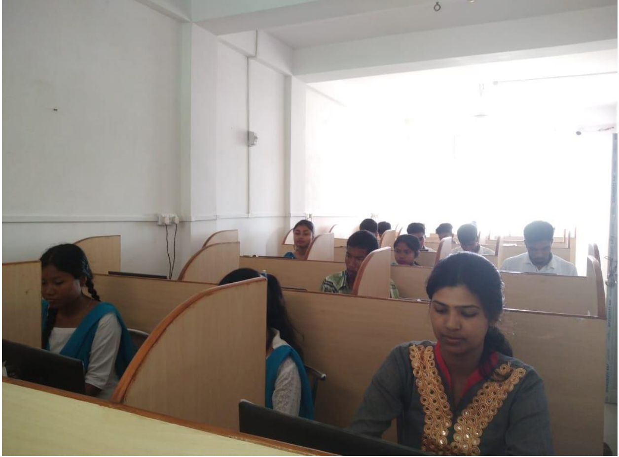
COMPUTER CLASS IN SESSION FOR THE ACADEMIC PERIOD 2022-2023.