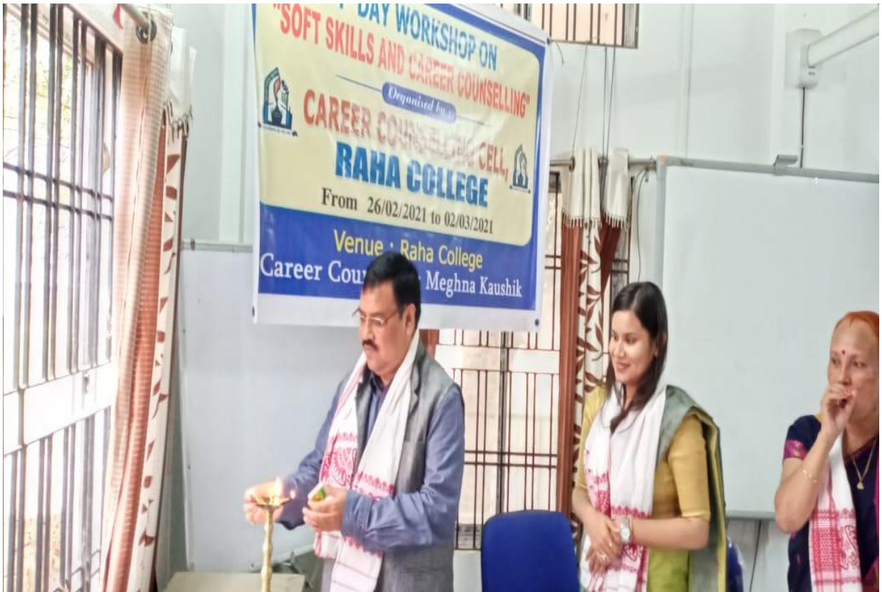
FOUR DAYS SOFT SKILLS AND CAREER COUNSELLING WORKSHOP FROM 26/02/2021 TO 02/03/2021