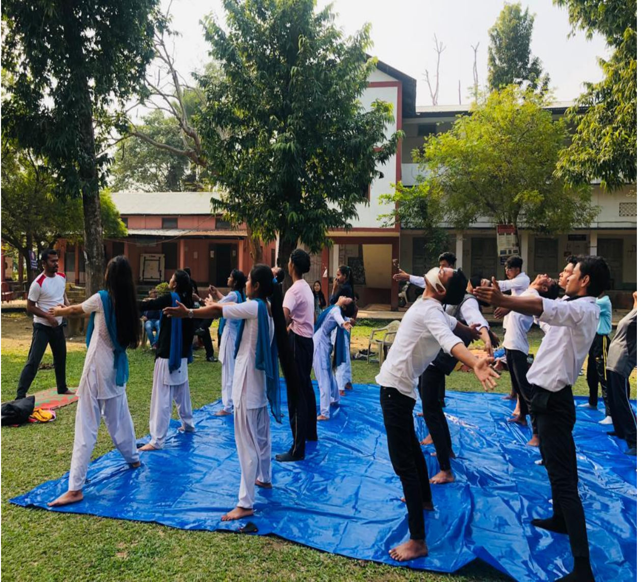
TEN DAY YOGA TRAINING FROM 20/04/2022 TO 29/04/2022